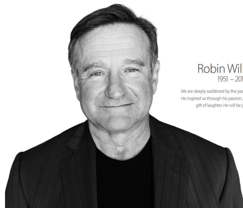
Robin Williams 1951 – 2014

We are deeply saddened by the passing of Robin Williams. He inspired us through his passion, his generosity, and the gift of laughter. He will be greatly missed.