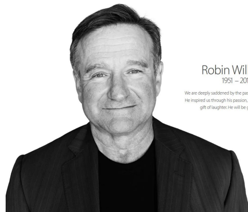
Robin Williams 1951 – 2014

We are deeply saddened by the passing of Robin Williams. He inspired us through his passion, his generosity, and the gift of laughter. He will be greatly missed.