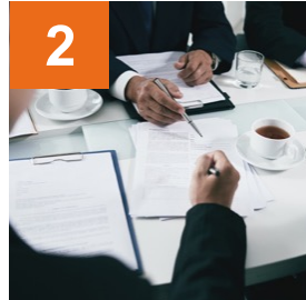
The Potential Client