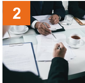
The Potential Client