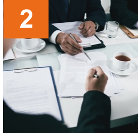
2 Documenting Representation