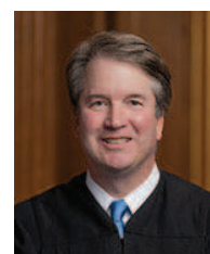
Brett M. Kavanaugh, Associate Justice