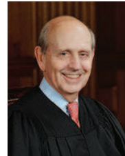
Stephen G. Breyer, Associate Justice