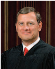
John G. Roberts, Jr., Chief Justice