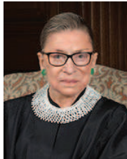
Ruth Bader Ginsburg, Associate Justice