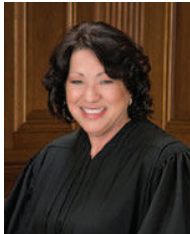
Sonia Sotomayor, Associate Justice