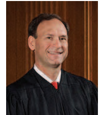
Samuel A. Alito, Jr., Associate Justice