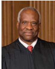
Clarence Thomas, Associate Justice