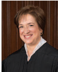
Elena Kagan, Associate Justice