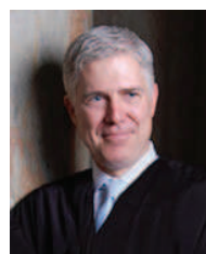
Neil M. Gorsuch, Associate Justice