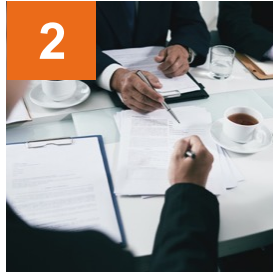
The Potential Client