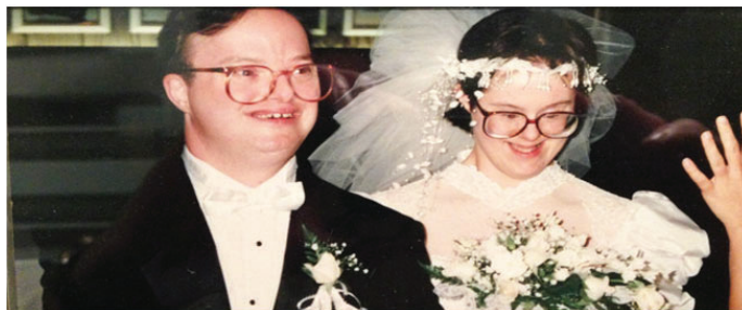
Celebrating 25 Years .