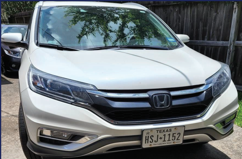
One of our vehicles.