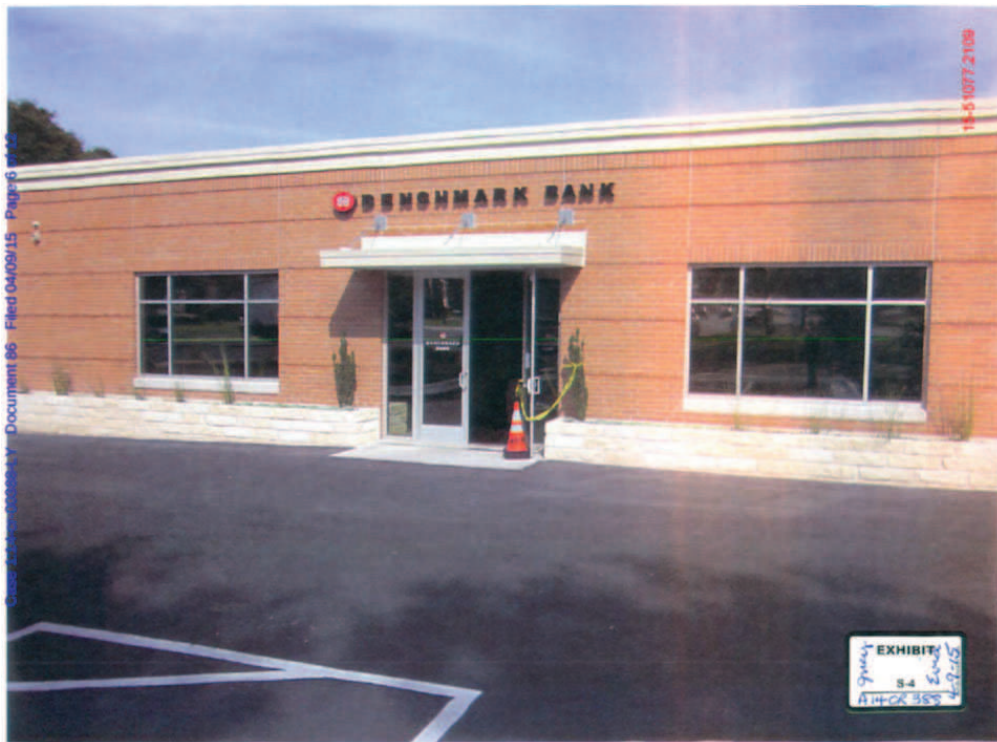
EXHIBIT S-4 ATK 3/8/15

“A police detective investigating a bank robbery fatally shot a man Friday afternoon after a foot chase and struggle that ended under a bridge in West Austin,” officials said.”