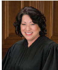
Sonia Sotomayor, Associate Justice