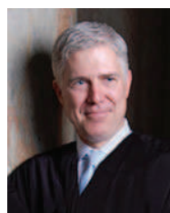
Neil M. Gorsuch, Associate Justice