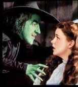
what my stepkids think I do