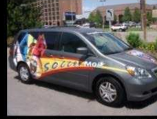
what my husband thinks I do