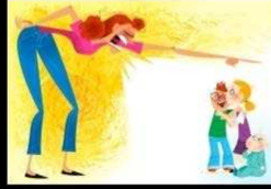
what my mother in law thinks I do