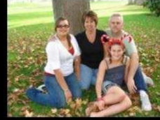
what I really do