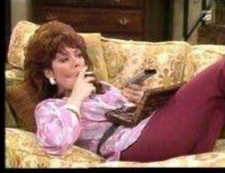
what the birthmother thinks I do