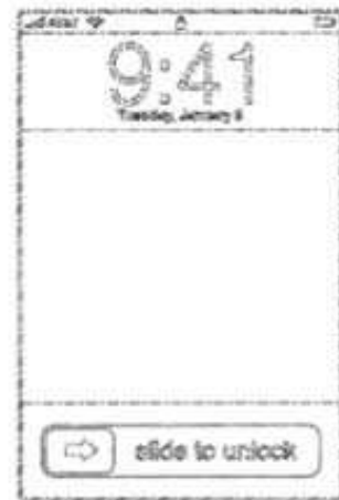
Apple’s US D675,639 Slide-to-Unlock Design Patent

Design patents are governed by 35 U.S.C. §171, which provides that: [w]hoever invents any new, original and ornamental design for an article of manufacture may obtain a patent therefor, subject to the conditions and requirements of this title. According to In re Zahn , 617 F.2d 261, 204 USPQ 988 (CCPA 1980), 35 U.S.C. §171 refers not to the design of an article but to the design for an article, and is inclusive of ornamental designs of all kinds, including surface ornamentation as well as configuration of goods.