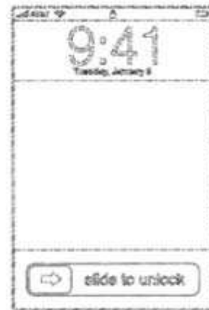
Apple’s US D675,639 Slide-to-Unlock Design Patent

Design patents are governed by 35 U.S.C. §171, which provides that: [w]hoever invents any new, original and ornamental design for an article of manufacture may obtain a patent therefor, subject to the conditions and requirements of this title. According to In re Zahn , 617 F.2d 261, 204 USPQ 988 (CCPA 1980), 35 U.S.C. §171 refers not to the design of an article but to the design for an article, and is inclusive of ornamental designs of all kinds, including surface ornamentation as well as configuration of goods.