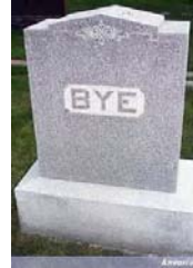
Wrongful death or estate