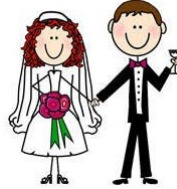
Employee participant; injured spouse; derivative claimant