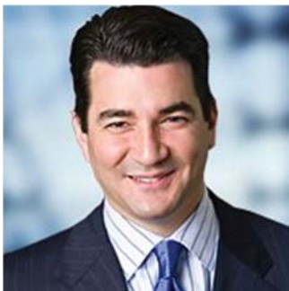
Dr. Scott Gottlieb Nominee for FDA Commissioner