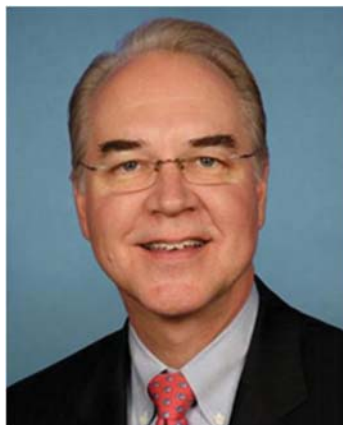
Dr. Tom Price HHS Secretary