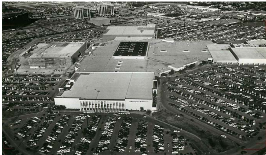
Valley View Mall Dallas Texas Circa 1982