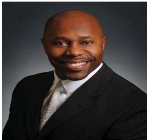
Monté L. Williams Emergency Response Team