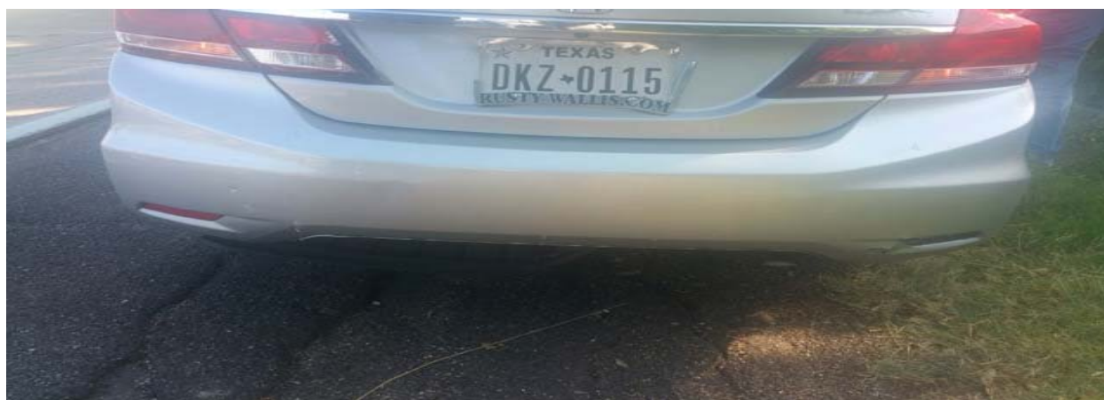
Damage We “See” Often – Minimal Visible Damage