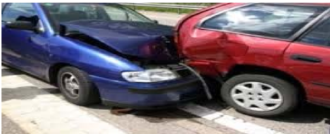
Damage We Like To See