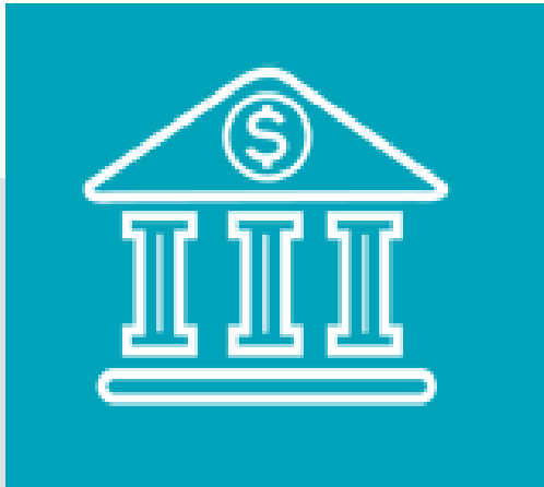
529 College Savings