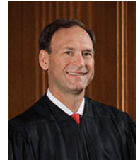
Samuel A. Alito, Jr., Associate Justice