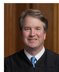
Brett M. Kavanaugh, Associate Justice