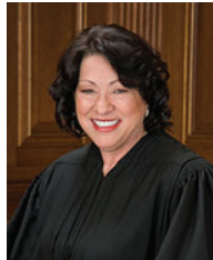
Sonia Sotomayor, Associate Justice