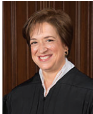
Elena Kagan, Associate Justice