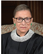
Ruth Bader Ginsburg, Associate Justice