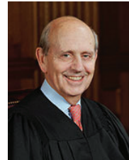
Stephen G. Breyer, Associate Justice