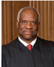
Clarence Thomas, Associate Justice