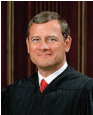
John G. Roberts, Jr., Chief Justice