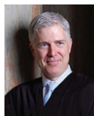
Neil M. Gorsuch, Associate Justice