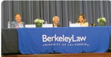
Judges Show Their Human Side, Discuss Partisanship and Social Media at Berkeley... law.com