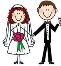
Employee participant; or injured spouse; or derivative claimant