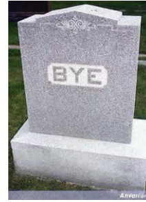
Wrongful death or estate

Start early. Be consistent. Be strategic.