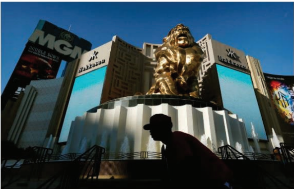
MGM Resorts International acknowledged that it was the victim of a data breach last year. A firm that monitors cybercrimes said 10.6 million people were affected.