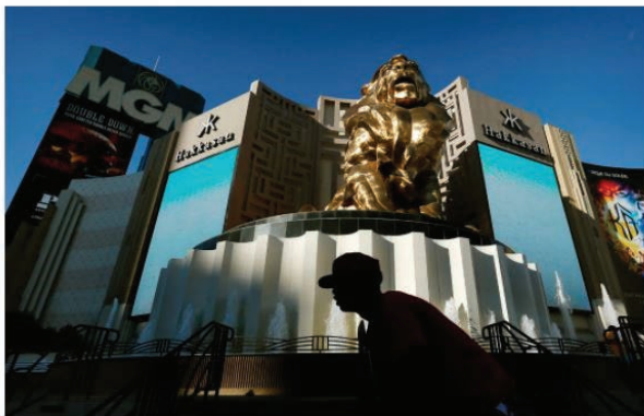
MGM Resorts International acknowledged that it was the victim of a data breach last year. A firm that monitors cybercrimes said 10.6 million people were affected.

Researchers have found 142 million personal details from former guests at the MGM Resorts hotels for sale on the Dark Web, evidence that a data leak from the hotel chain last summer may be far bigger in scope than previously thought.