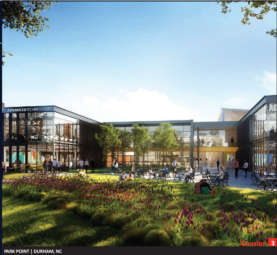
PARK POINT | DURHAM, NC

Life Science and Industrial continue to be the darlings for the recovery