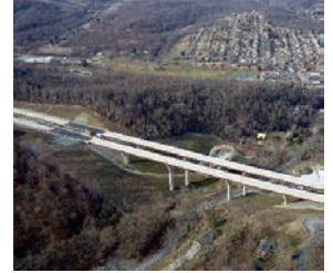
The ecological uplift of a mitigation project helps offset unavoidable impacts of infrastructure projects like highway expansions.