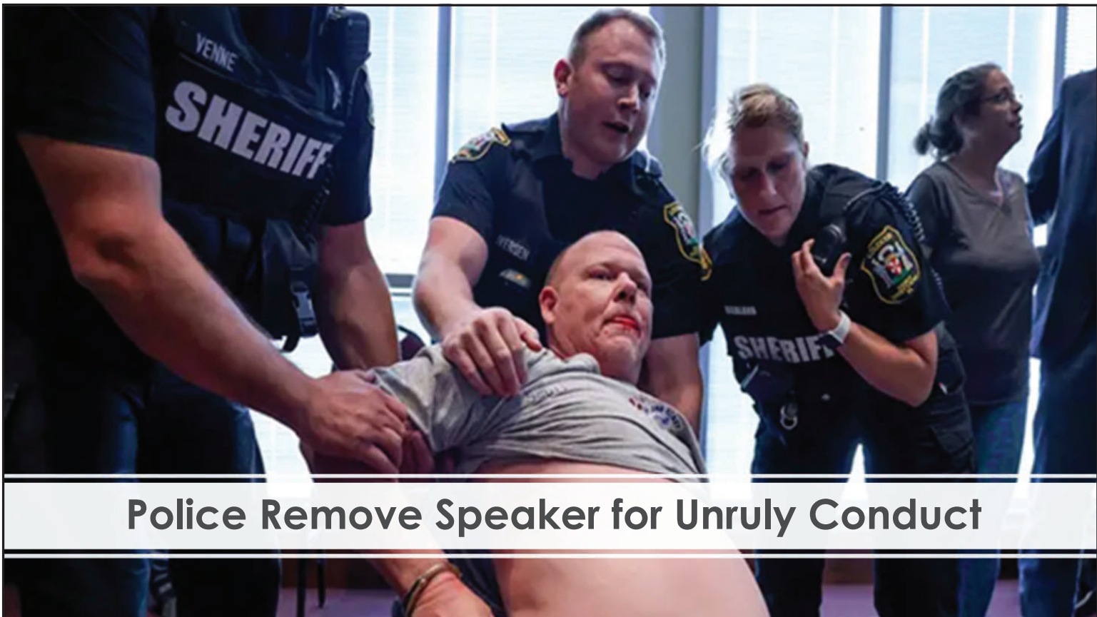
Police Remove Speaker for Unruly Conduct