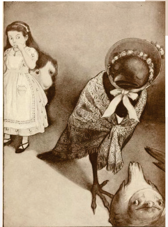
“On various pretexts they all moved off.” Lewis Carrol’s Alice in Wonderland, illustration by Peter Newel.