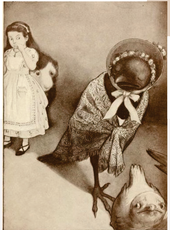
“On various pretexts they all moved off.” Lewis Carrol’s Alice in Wonderland, illustration by Peter Newel.