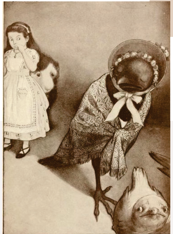
“On various pretexts they all moved off.” Lewis Carrol’s Alice in Wonderland, illustration by Peter Newell.