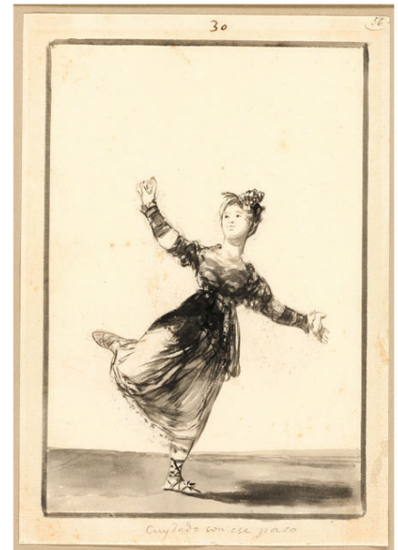
Francisco José de Goya y Lucientes . Be Careful with that Step! 1816–1820. The Art Institute of Chicago.