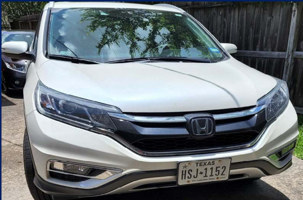
One of our vehicles.