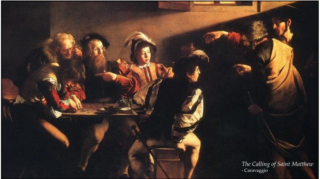
The Calling of Saint Matthew - Caravaggio