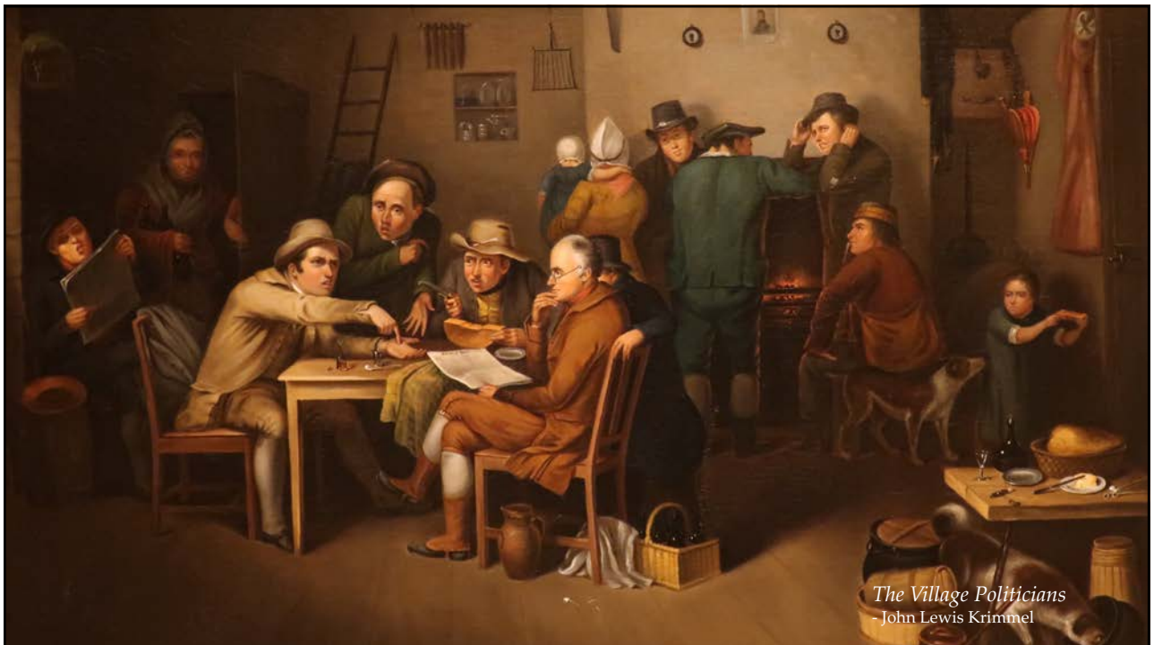
The Village Politicians - John Lewis Krimmel