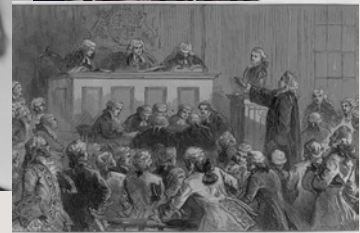
"By no means," continued Franklin, in his slow, stolid, solemn voice. "It is not the law, printing and publishing of a paper that will make it a fact; the words themselves must be chosen, that is, taken, understood, and written, and they must be true." (Page 108)