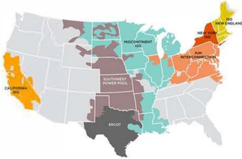
Map of Regional Transmission Organizations and Independent System Operators