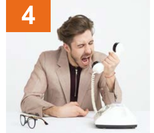
Running Your Office