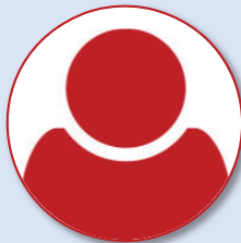
Vacant Republican Member Seat