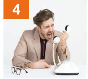
Handling Client Complaints